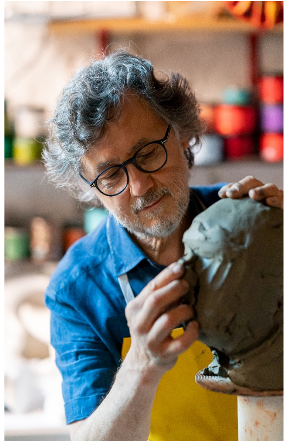
Mask maker from atelier Ca'Macana at work

With more than 60 artisans, manufacturers, workshops, galleries and museums taking part, there are myriad ways to experience Homo Faber in Città. Either follow one of the specially curated thematic itineraries available through the website and app, or create your own bespoke tour based on your particular desires and interests.