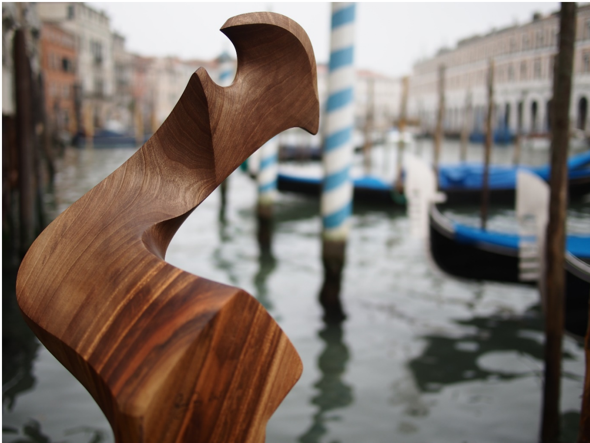
Piece crafted by rowlock maker Piero Dri ©All rights reserved

Explore the city in a new way by taking a bespoke, self-guided tour of Venice's hidden crafts workshops